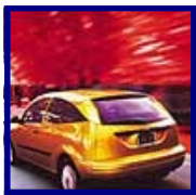
Grand Prize 2001 Ford Focus

At the January 4th meeting, yours truly will be soliciting volunteers for the next few week-ends to sell Youth & Community (Y&C) tickets at Safeway, Starbucks, and Albertson's. Not only is this your best chance to sell the tickets that I