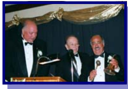
Three Generations of Millbrae Lions Presi-