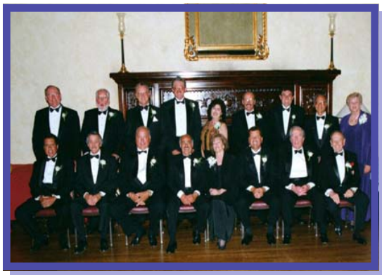
The New Millbrae Lions Board for Year