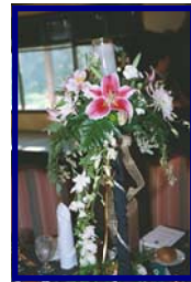
Nancy Montes' Beautiful Flowers