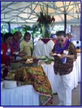
Lots of Great Looking Eats at the Cocktail Party