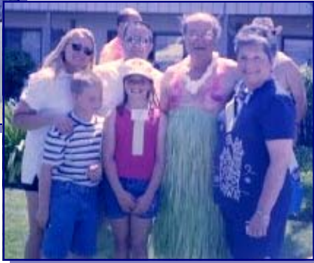
Millbrae Lions Representatives at the Cocktail Party for Lion Art