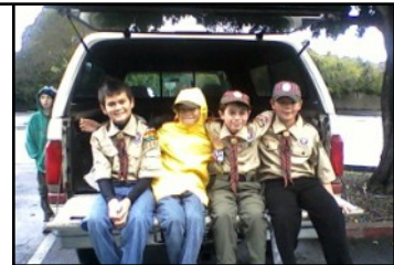
Cubs Scout Pack 355 successful food drive.