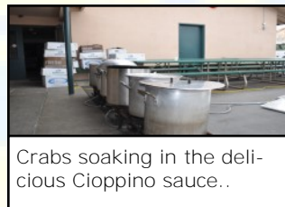
Crabs soaking in the delicious Cioppino sauce..