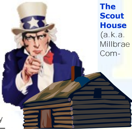
The Scout House (a.k.a. Millbrae Com-

The April 20 General Meeting is a VERY IMPORTANT NIGHT. It is both our election of officers, and Youth in Government Night. Please be sure to arrive for a 7pm dinner and demonstrate our best Lion's welcome for these bright young people. This is a spouse night and we look forward to enjoying the company of our Partners in Service. Jackets are requested. There will be parents and community members present who are potential members. Let's put our best foot forward.